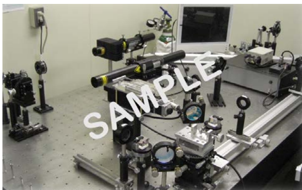
Fig. 2 Two or more lines are flushed left under the figure. Add a line space above the figure caption. Two or more lines are flushed left under the figure. Add 1 line space above the figure caption.

4.2 Tables When tables are mentioned in the text, they should be referred to as Table 1, Table 5, i.e. , with a single letter space between the word “Table” and the Arabic numeral.