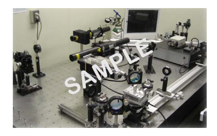
Fig. 2 Two or more lines are flushed left under the figure. Add a line space above the figure caption. Two or more lines are flushed left under the figure. Add 1 line space above the figure caption.

4.2 Tables When tables are mentioned in the text, they should be referred to as Table 1, Table 5, i.e. , with a single letter space between the word "Table" and the Arabic numeral.